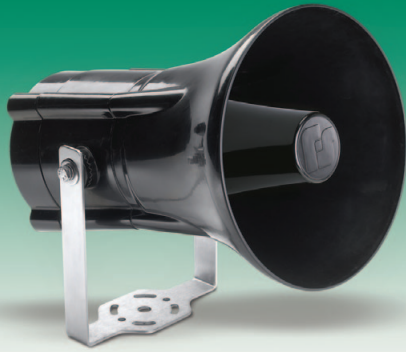
Shown with swivel mounting bracket